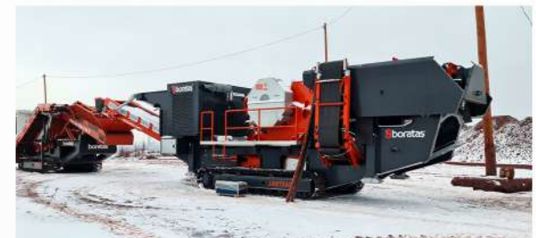
BUILT FOR HARSH SITUATIONS INCLUDING EXTREME COLD ENVIRONMENTS EASY TO TRANSPORT DUE TO FOLDABALITY